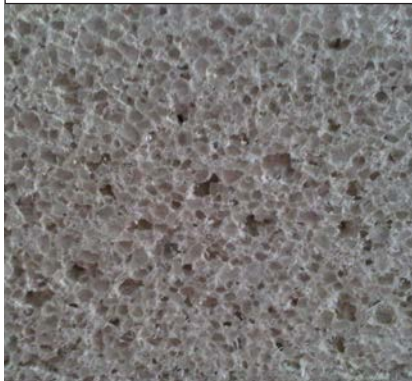
A cross-section through the hardened high-performance insulating plaster

Aerogels are manufactured from silicate material and consist almost completely (90 to 98%) of air. The extremely porous microstructure has the effect of entraining air molecules, thus severely limiting its ability to transmit heat. This pure mineral raw material forms the basis for the production of the highest performance insulating material that exists. Fixit 222 Aerogel high-performance insulating plaster was developed in collaboration with EMPA in the course of a project lasting several years. It has been available on the market since 2012.