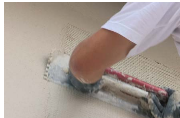
Embedding the glass fibre reinforcing mesh